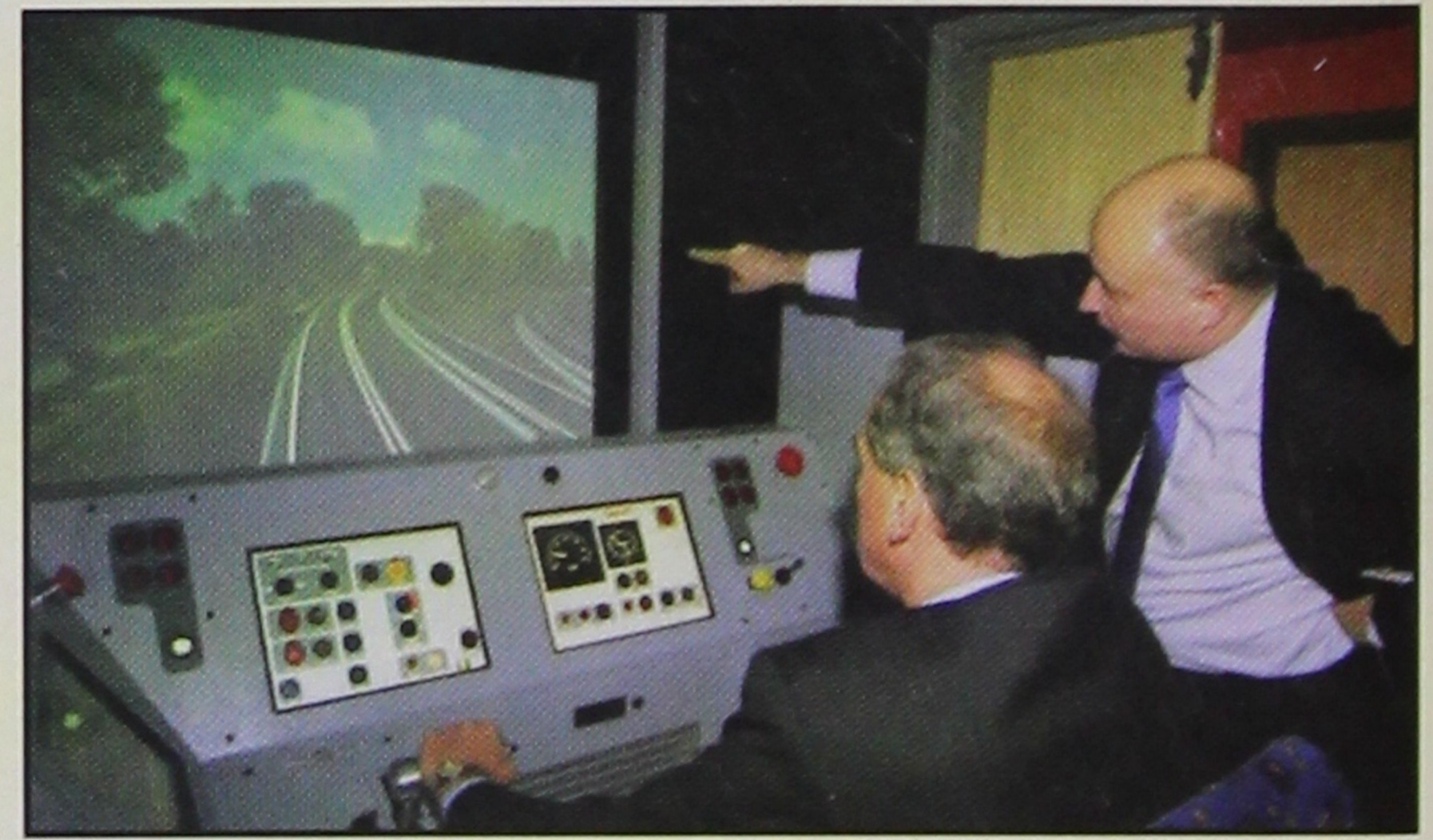
Latest Developments In Simulation Technology