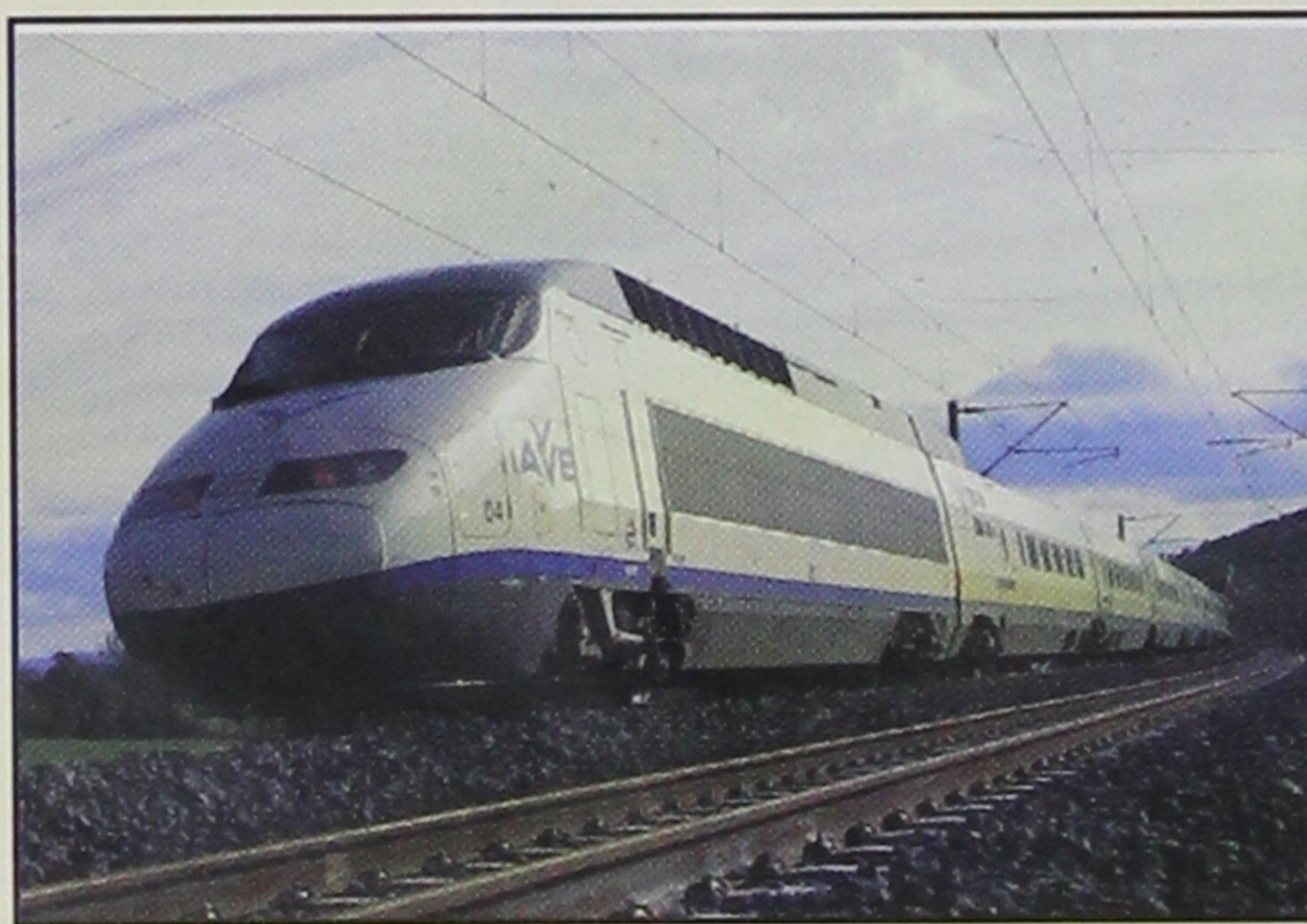
Spain Expands Its High-Speed Network