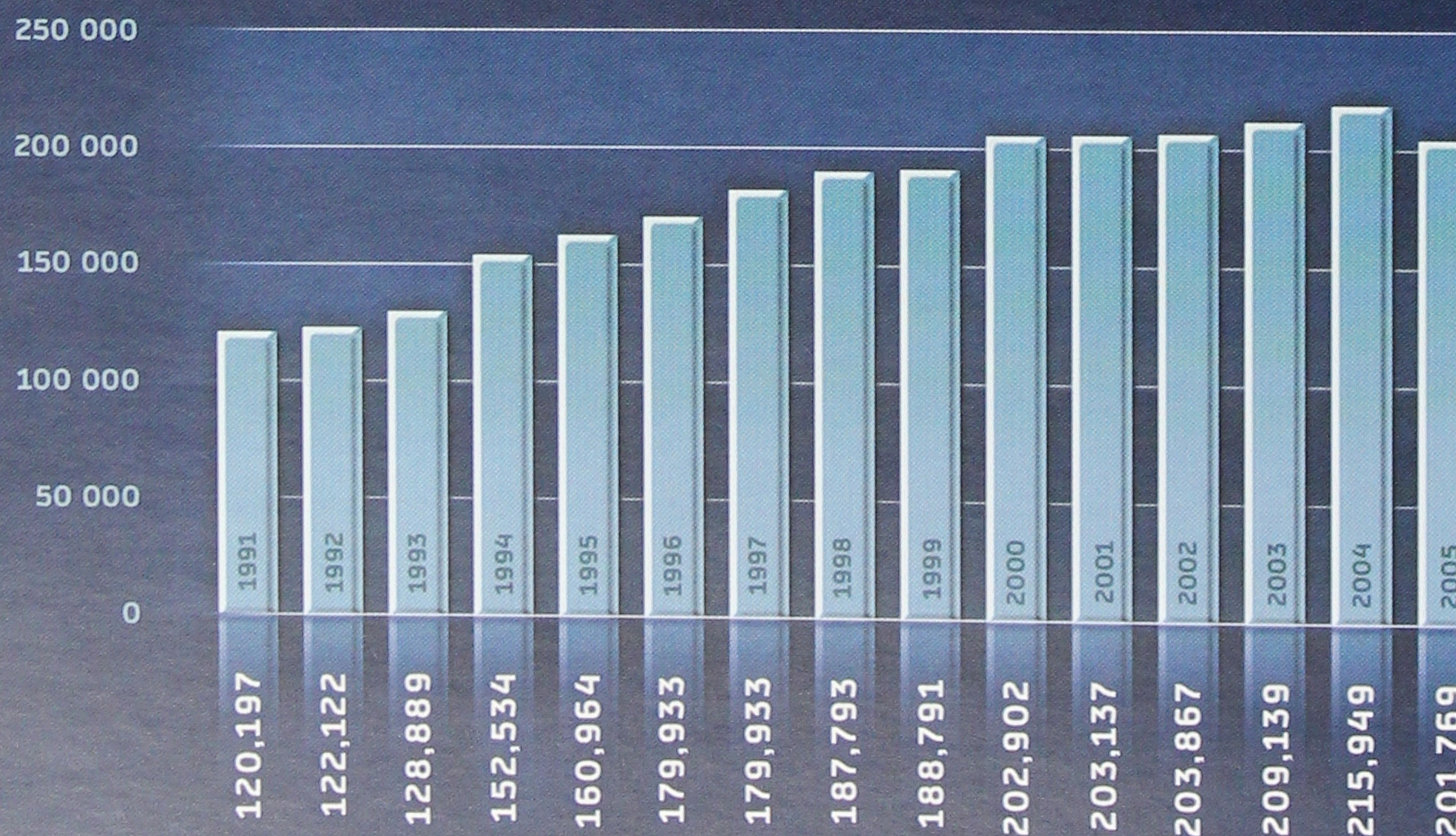
TRENDS IN INTERMODAL TRAFFIC CARRIED BY RAIL IN THOUSANDS OF TONNES